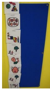
Example of Level 2.